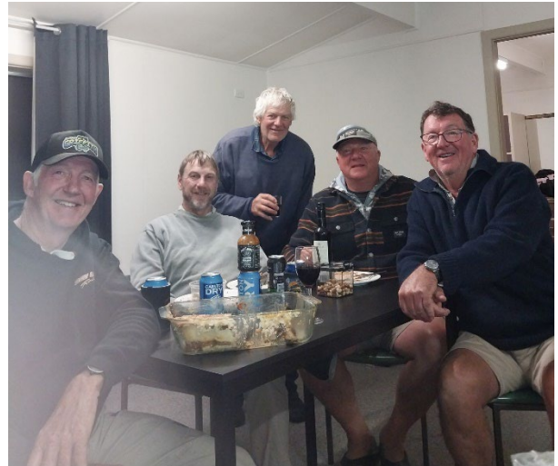
The Crew enjoying some drinks and camaraderie over an evening meal of Lasagna.