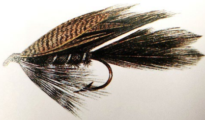
Ace of Spades

WING: Tied matuka style with four black cock hackles, with bronze mallard over.