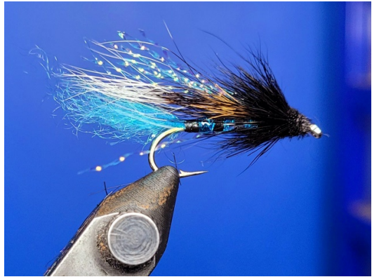
This fly has been very effective this year, tied to match the damsel flies in the lake.

I fish an 8-weight rod. A 6 weight will handle bass but the 8 has more stopping power and I do encounter carp, its handy to have a strong rod when this occurs. The bass are not line shy, eight foot of ten Ib. leader, either mono or Fluro carbon works fine. Sometimes I take two rods. One with mono, the other with Fluro carbon, just so I can fish dry or wet with less time switching systems. A shooting head line is a good choice mainly to reduce back casts when trying to avoid trees on the back cast. My thoughts at present are that bass at times selectively feed on insects, crustaceans, and smaller fish. However, matching the fly perfectly is not totally needed, matching Colour and size is more effective.